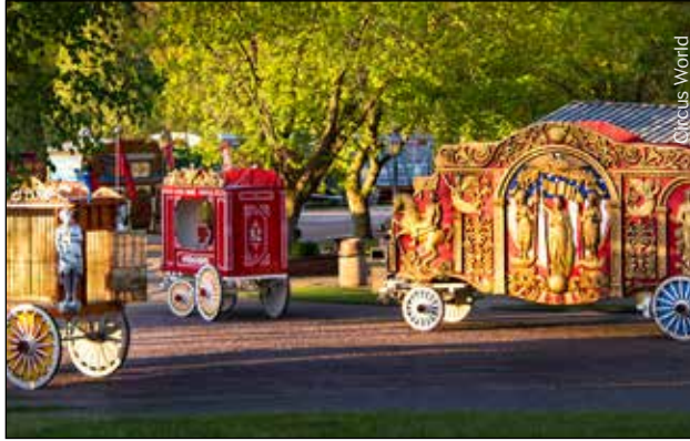
View vintage wagons at Circus World