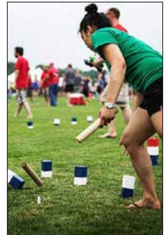
Learn the game of Kubb

Not far from Wisconsin Rapids is Wausau. We'll enjoy a delightful lunch at Back When Café* and a visit to Rib Mountain State Park*. You'll take in the beauty of the fall colors from the overlooks, and if you're willing, the observation tower. Next "on tap" is a tour of the Jacob Leinenkugel Brewing Co.®, infamous as a symbol for