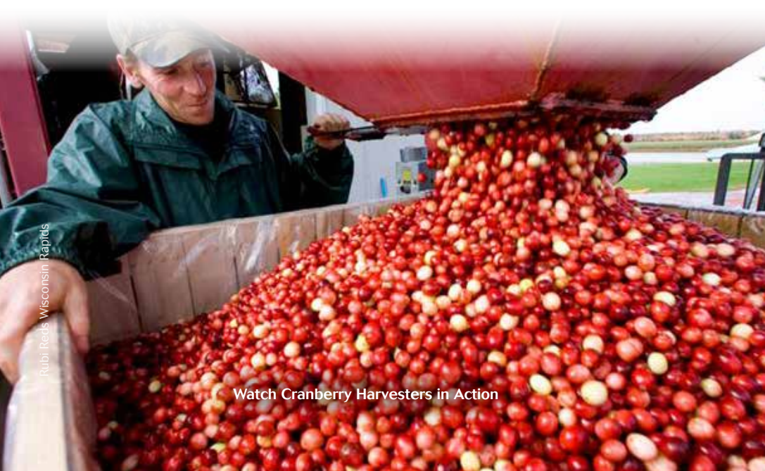
Watch Cranberry Harvesters in Action

Many may remember the Circus Parade held each July in Milwaukee. Today, relive some of that excitement with a visit to Circus World Museum* in Baraboo. Site of the original Ringling winter quarters, you'll see historic circus wagons, memorabilia and more. Finally, a delicious farewell luncheon is served at Log Cabin Restaurant and Bakery*. Save room for a tasty piece of pie. Meals: B, L