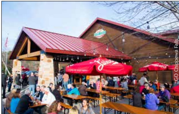
Taste the Flavor of the Northwoods at The Leinie Lodge®